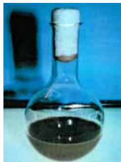
A shake flask with bioemulsified crude oil

A large number of bacteria, yeast and fungi are able to metabolize one or more compounds in crude oil. A few species of microorganisms, in particular bacteria, are able, by de novo synthesis, to produce surface active compounds, so called biosurfactants. Crude oil emulsifying microorganisms are able to transform crude oil into an oil-in-water emulsion, often by a combination of production of biosurfactants and generation of surface active degradation products through their metabolism of crude oil components. Oil-in-water emulsions made by good crude oil emulsifying bacteria can be very stable and stored for years without significant coalescence. Furthermore, crude oil emulsifying microorganisms are able to transform also very weathered crude oil into an oil-in-water emulsion.