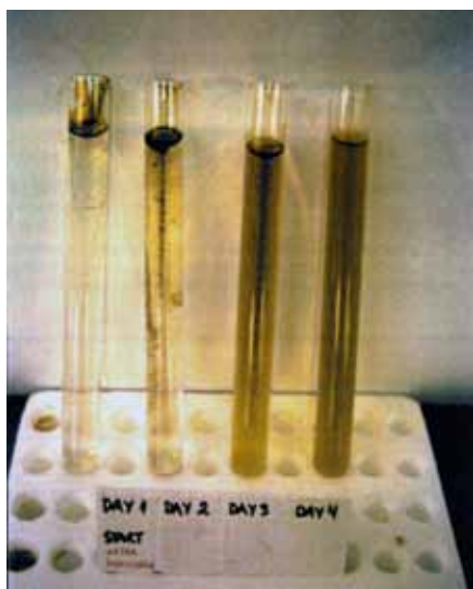
In less than one day the chocolate mousse in the flume basin was dispersed in the water as an unstable oil-in-water emulsion. Over the next days the average oil droplets size became smaller and smaller, and the emulsion more and more stable.