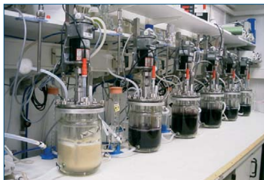
One of the two jar fermentor laboratories, each with 16x3 liter-fermentors.

The aim is to isolate microorganisms from marine environment that produce valuable products with an industrial potential. Our current focus is on isolation and characterization of microorganisms that produce antibacterial and anticancer compounds. Several novel compounds with interesting bioactivities have been identified and are currently evaluated for future therapeutic use. This work is carried out as a collaboration between SINTEF, NTNU and the University of Bergen.