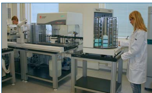
The high-throughput screening laboratory, one of the two liquid handling work stations.

The essential amino acids L-lysine and L-glutamate are currently produced from low-cost carbohydrates and the global market is rapidly growing. Methanol offers several advantages as an alternative substrate and is produced in large quantities from natural gas in Norway. Based on the thermophilic and methylotrophic bacterium Bacillus methanolicus , we are using metabolic engineering towards industrial production of L-lysine and L-glutamate from methanol. The projects are a collaboration between SINTEF, NTNU and The University of Minnesota, USA.